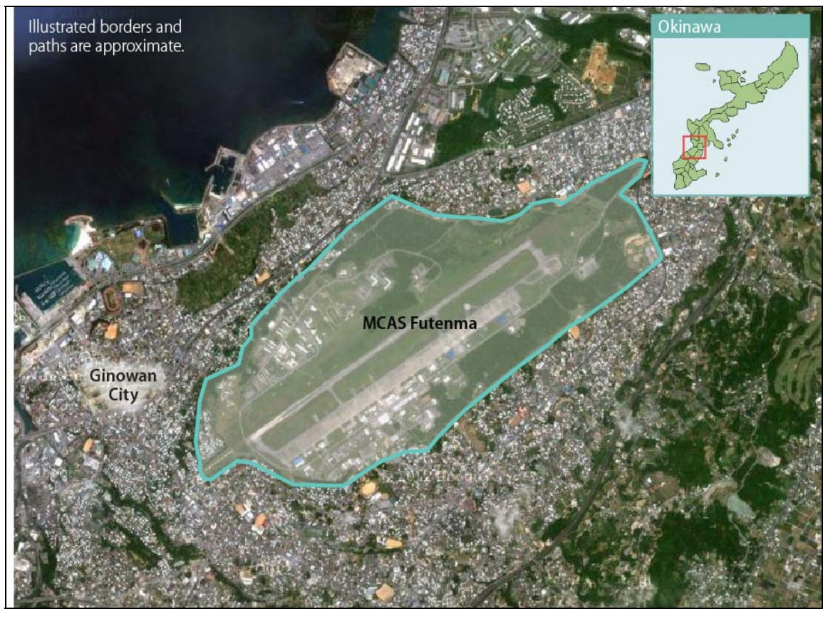
Figure 4. MCAS Futenma