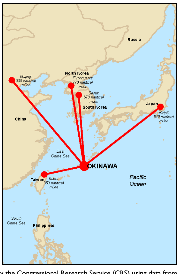
Figure 1. Okinawa's Strategic Location

Source: Map created by the Congressional Research Service (CRS) using data from the U.S. State Department, 2009; and ESRI Data 10, 2009.