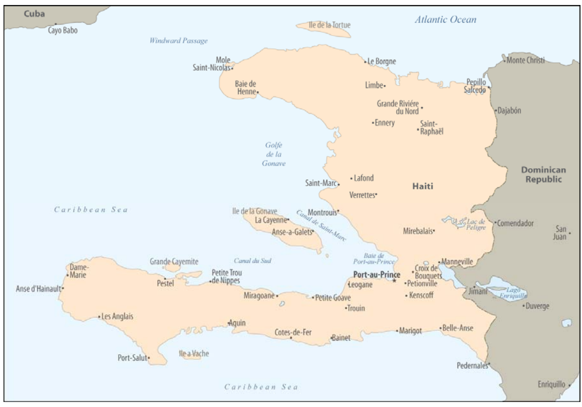
Figure I. Map of Haiti